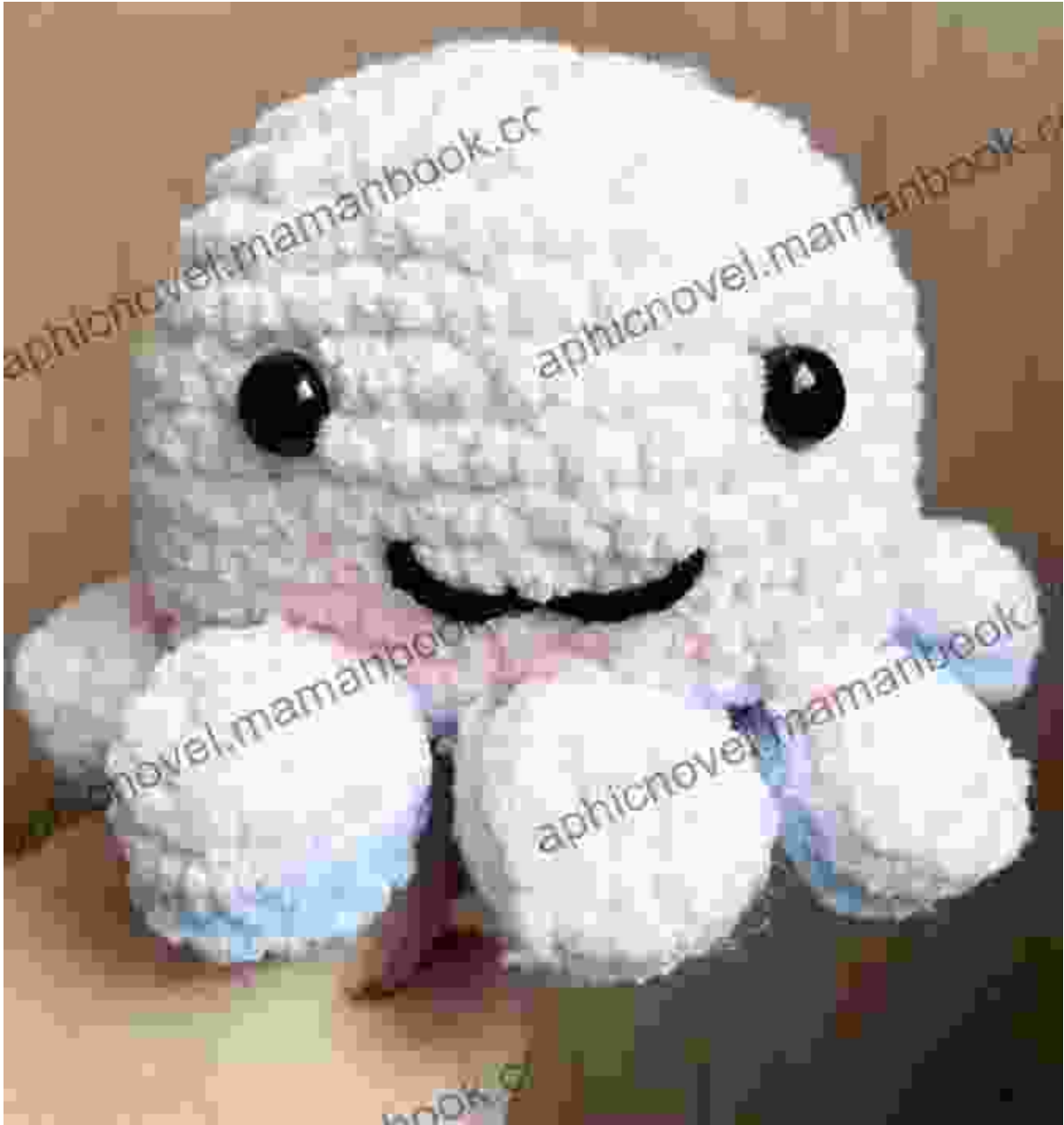
Unlovable Octopus By ChiWei Ranck