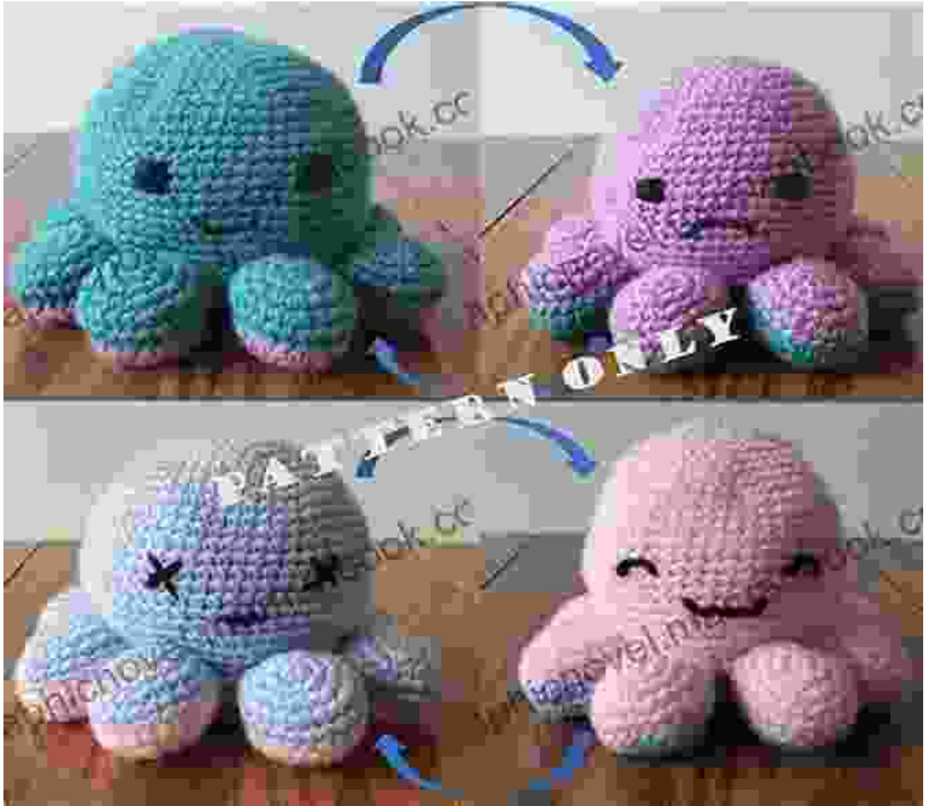
Ugly Octopus By PlanetJune